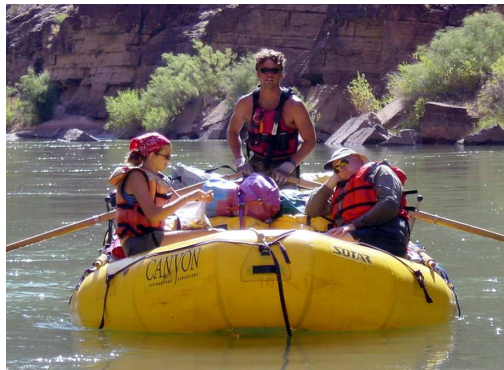
Just Drifting Along. Maybe the best part!