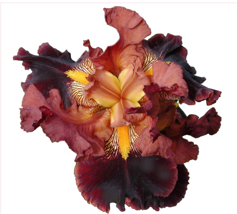
An Iris Posing for Me

We spent a number of weekends in the fall looking for a mountain cabin retreat. We saw some beautiful property, but haven't yet bitten the bullet. It would be wonderful to be able to head to the mountains for our very own spot on a mountain stream. Stay tuned!