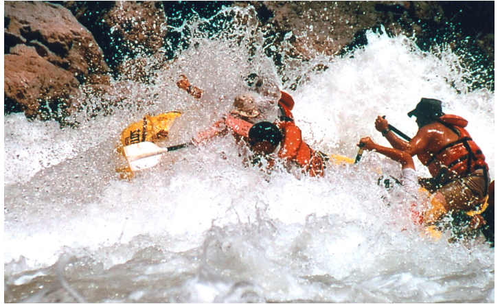
Hitting the Wall