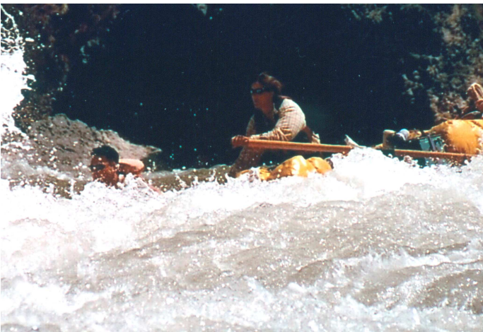
Into the Hole