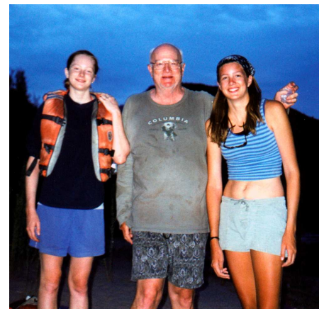
4:30 AM Last Day. 90° and Grungy!