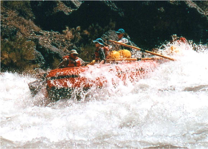
Heading into Lava Falls

Lava Falls was the last major rapid on the trip. It was also the only one where pictures can be taken.